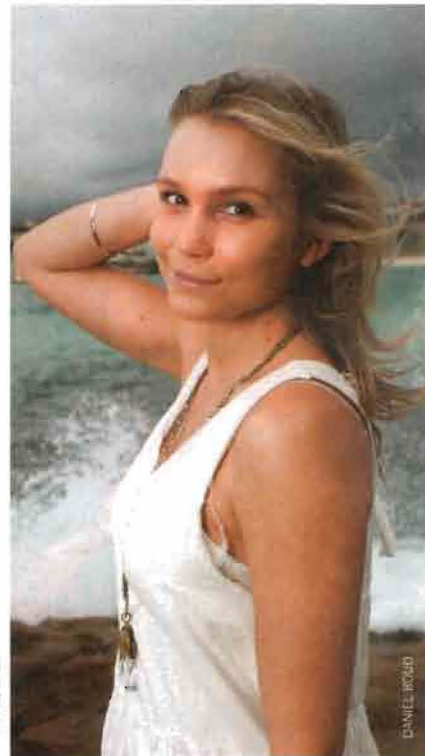
Front row centre